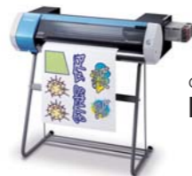
Optional Stand PNS-24

About Metallic Silver Ink Due to the nature of the metallic silver ink, the pigment in this ink will settle in the cartridge and ink flow system, requiring you to shake the cartridge before each use. Outdoor durability is three years for CMYK inks, one to three years for metallic silver ink, depending on the media used. Roland strongly recommends lamination for both indoor and outdoor graphics to ensure the quality of metallic silver ink.